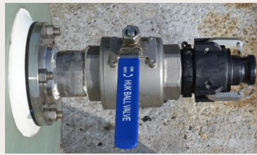
3 inch valve and 2 inch reducer